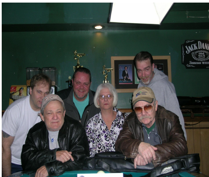
3rd Place Pick Pockets $450.00