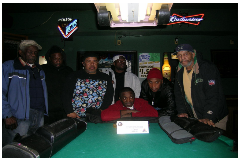
2nd Place Free Agents $600.00