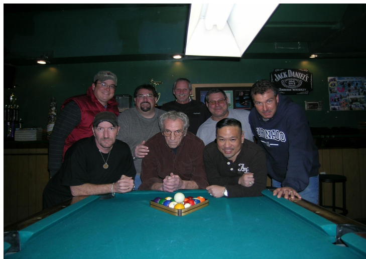
1st Place - Champions Rackrunners $1,200.00