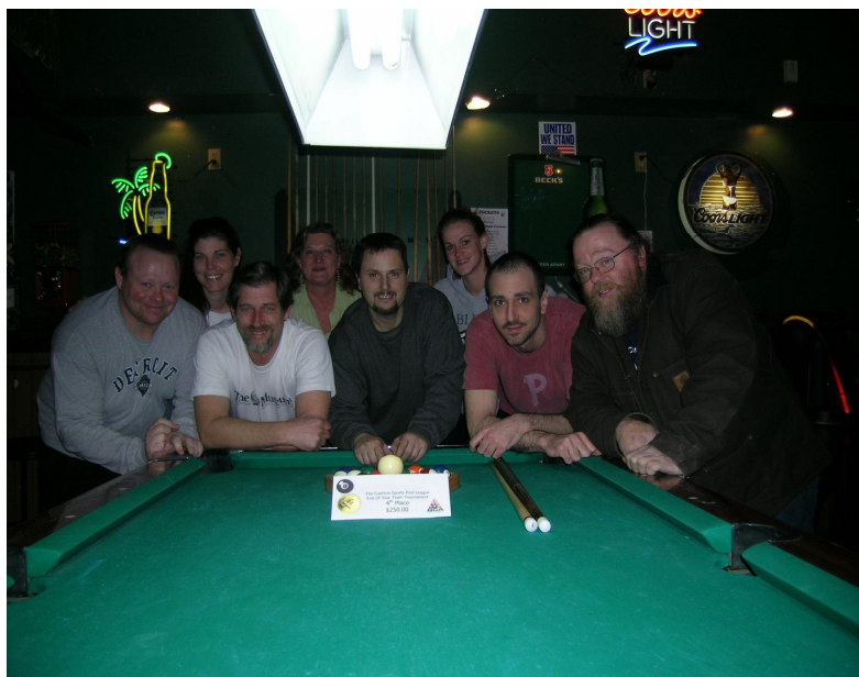
4th Place Rackers $250.00